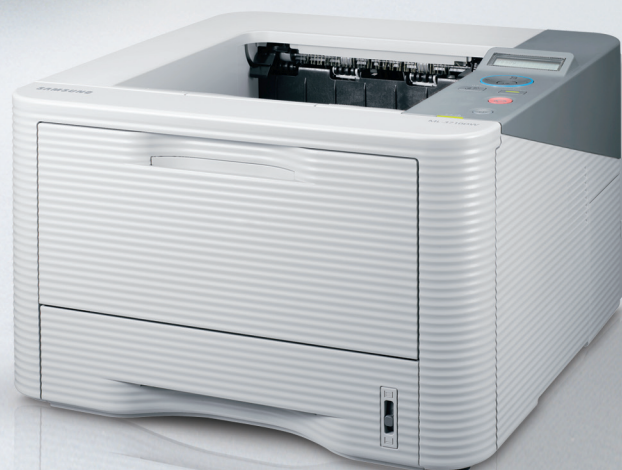
Samsung Monochrome Laser Printer ML-3310/3710 Series